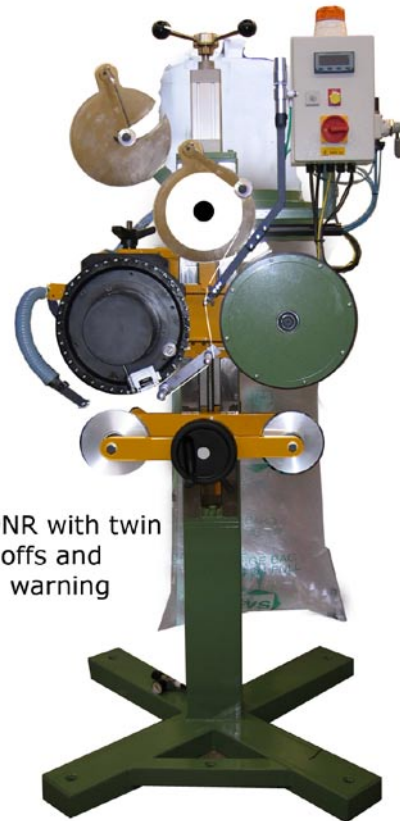
WS469NR with twin foil let-offs and low foil warning

8. The support guide rolls are coupled by a PU drive. Running on sealed bearings, no maintenance is required. Rolls may be vee grooved or formed as required.