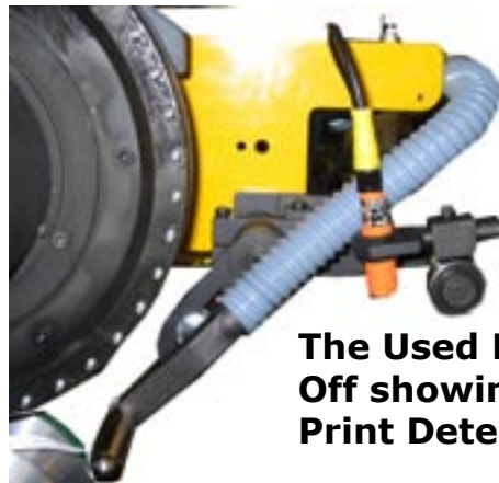
The Used Foil Take-Off showing the No-Print Detector