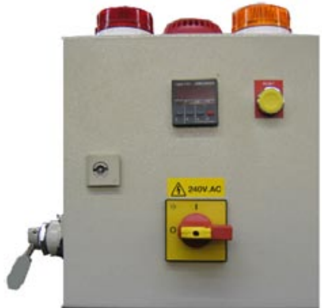
Control Panel of the WS429XNR

8. The support guide rolls are coupled by a PU drive. Running on sealed bearings, no maintenance is required. Rolls may be vee grooved or formed as required.